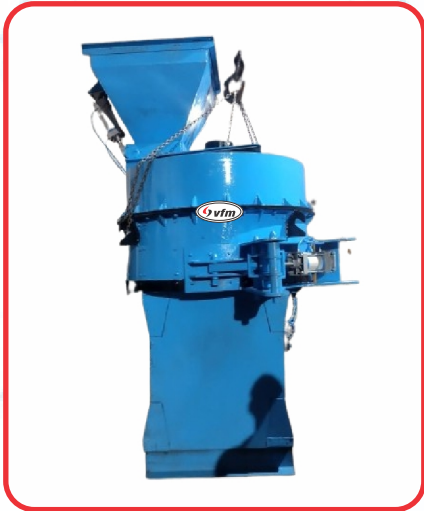
Intensive Sand Mixer