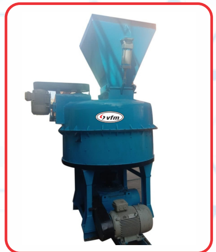
Intem Sive Mixer