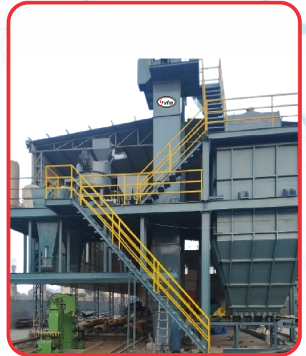
Foundry Sand Plant